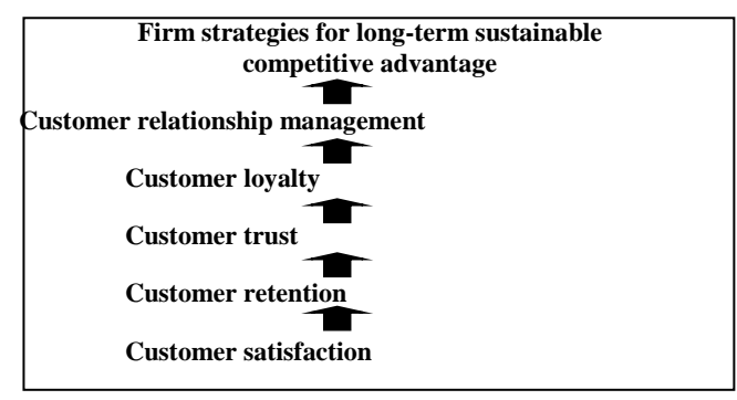
Figure 3.Management of customer satisfaction leading to longterm sustainable competitive advantage

While (Sunder, 2009) offered a framework named "Customer satisfaction leading to long-term sustainable competitive advantage", which proved that management of customer satisfaction is a background of sustainable competitive advantage. This model could be constituted as a continuous approach of the aforementioned perception of (Sheth, 2001).